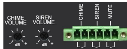
Dry contact inputs