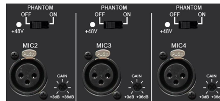
Mic Inputs with Phantom Power